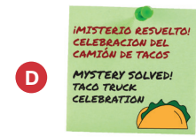
Final Prize: Customize, if desired