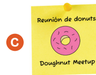
Mid-Competition Incentive: Customize, if desired