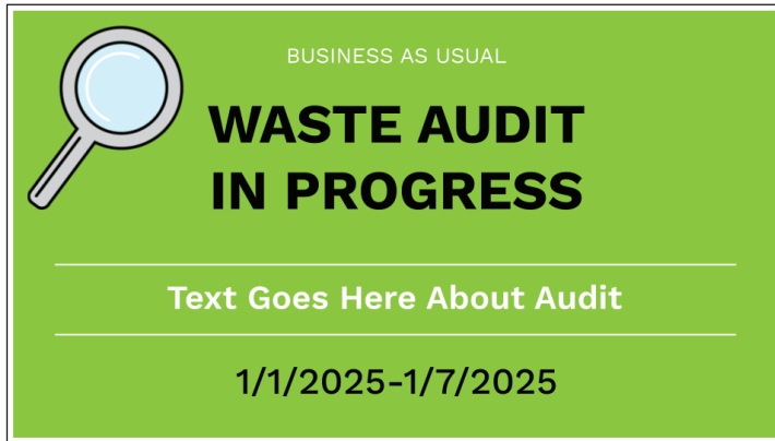
BUSINESS AS USUAL AUDIT SIGN

These graphics (provided in English and Spanish) in the toolkit can be customized to match your waste audit project. The green sign is used during the first part of the waste audit, the orange sign replaces it for the second part of the audit. Print at high resolution at the largest size you need for your space.