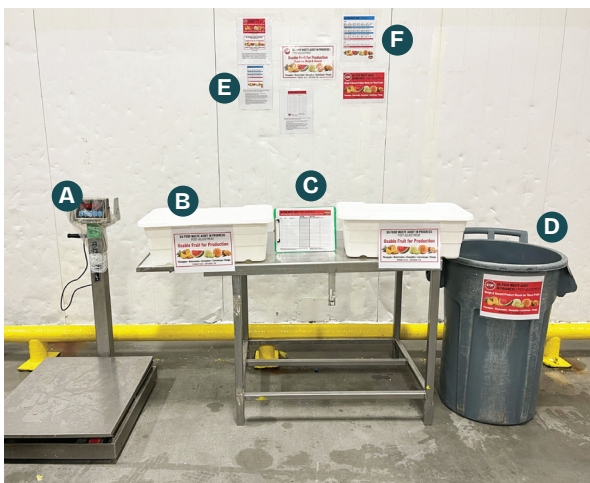
EXAMPLE OF SET UP FOR POST-ADJUSTMENT AUDIT