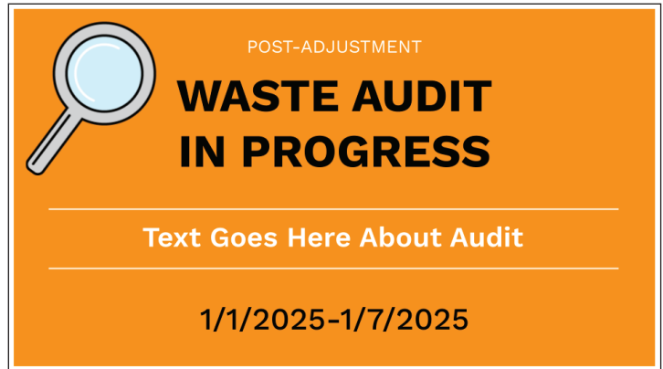
POST ADJUSTMENT WASTE AUDIT SIGN