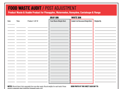
WASTE AUDIT MEASUREMENT SHEET (SAMPLE)