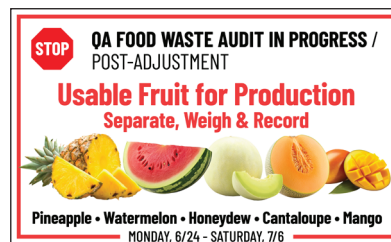
WASTE AUDIT SIGNAGE (SAMPLES)