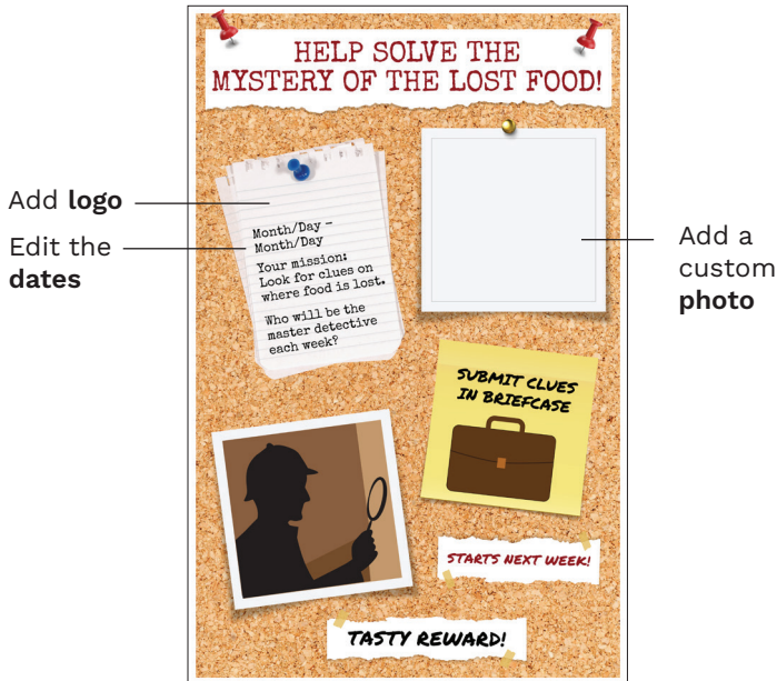
Pre-Competition Poster before customizing